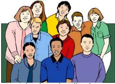
Wednesday Night Fellowship

Join us for our Mid-Week service on Wednesday's beginning at 5:45 pm with the Holy Communion followed by a potluck supper. Bring a dish to share and your favorite beverage of choice.